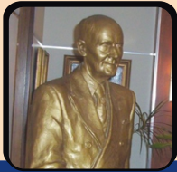
PAUL HARRIS FOUNDER THE ROTARY ORG